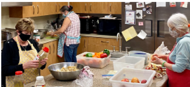
Our Foundation is here to help generous people support the imaginative vision of other ministries in the Diocese of Ontario

For more information about the Foundation, or to discuss making a legacy gift to support its ministry, please contact: