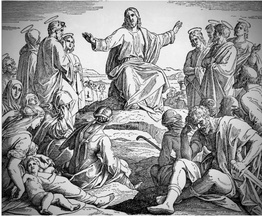
Sermon on the mount

Blessed are the poor in spirit, for theirs is the kingdom of heaven. Blessed are those who mourn, for they will be comforted. Blessed are the meek, for they will inherit the earth. Blessed are those who hunger and thirst for righteousness, for they will be filled. Blessed are the merciful, for they will receive mercy. Blessed are the pure in heart, for they will see God. Blessed are the peacemakers, for they will be called children of God. Blessed are those who are persecuted for righteousness' sake, for theirs is the kingdom of heaven. Blessed are you when people revile you and persecute you and utter all kinds of evil against you falsely on my account.